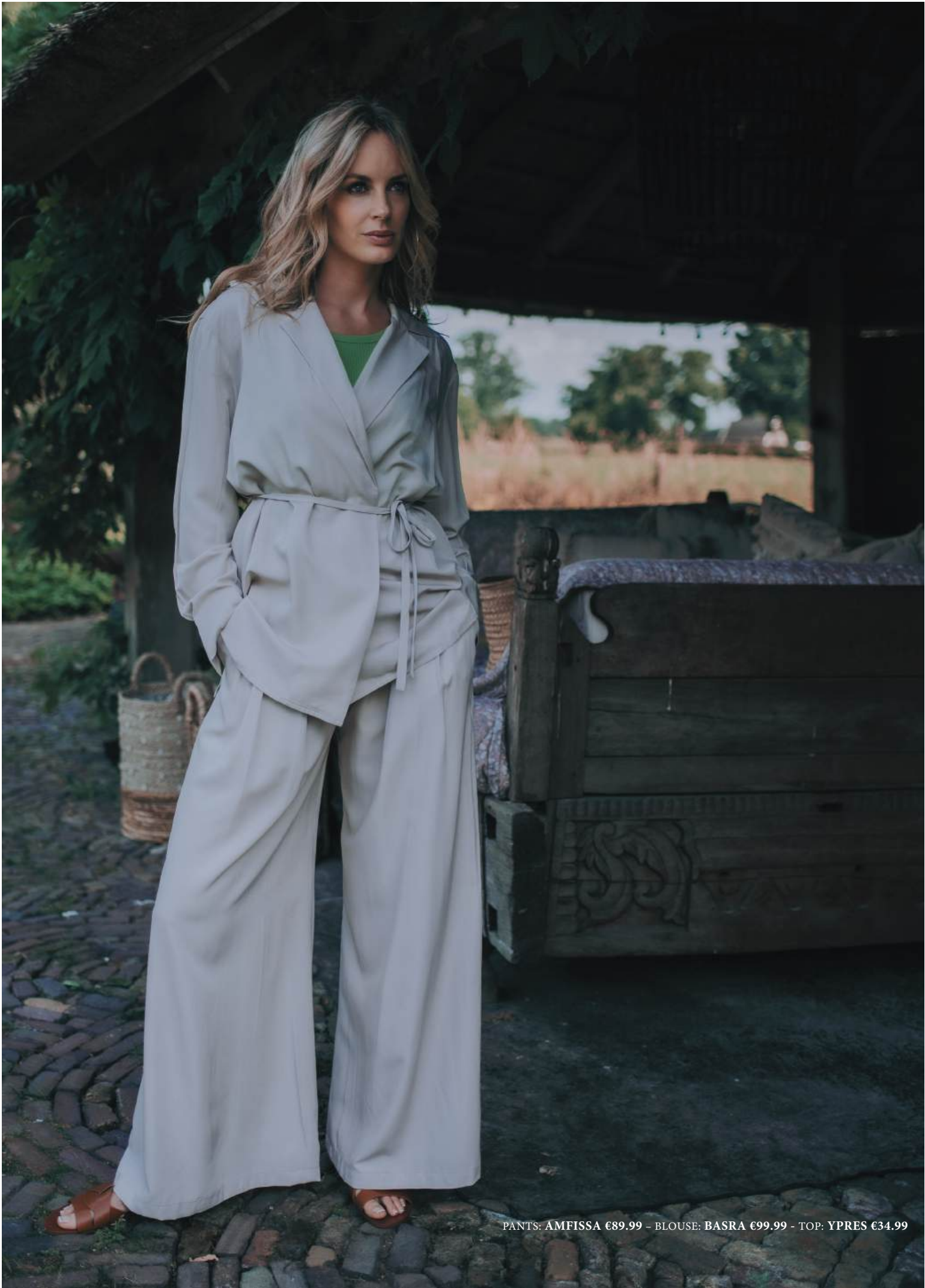
PANTS: AMFISSA €89.99 - BLOUSE: BASRA €99.99 - TOP: YPRES €34.99