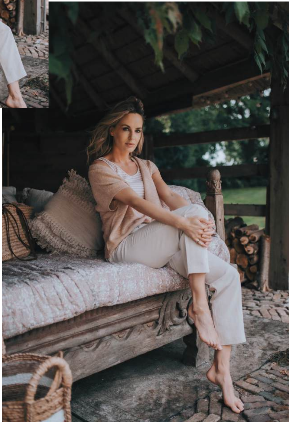
PANTS: KORCULA €109,99 - PULLOVER: LAMIA €99,99 - TOP: NAMUR €49.99