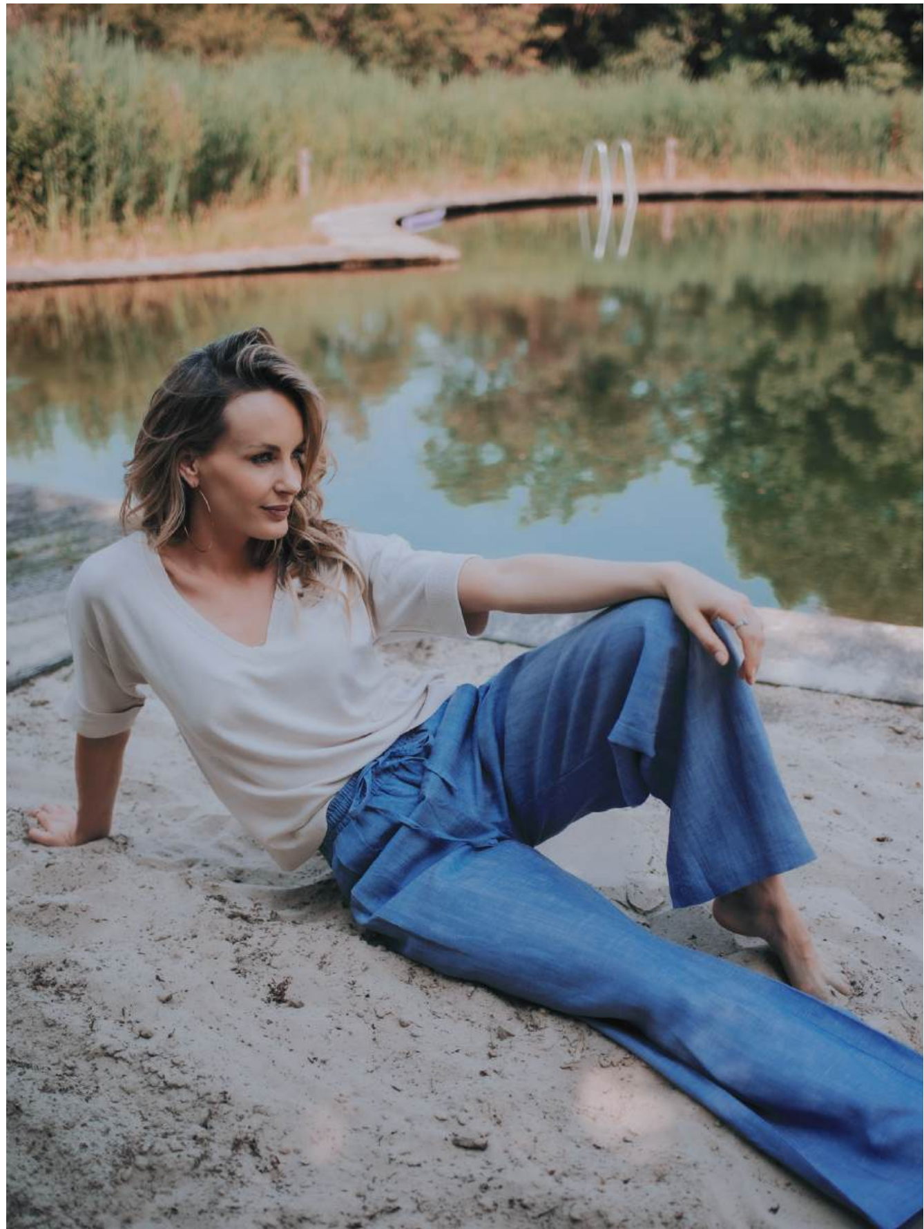
PANTS: PUNE €129.99 – KNIT: PYLOS €79.99