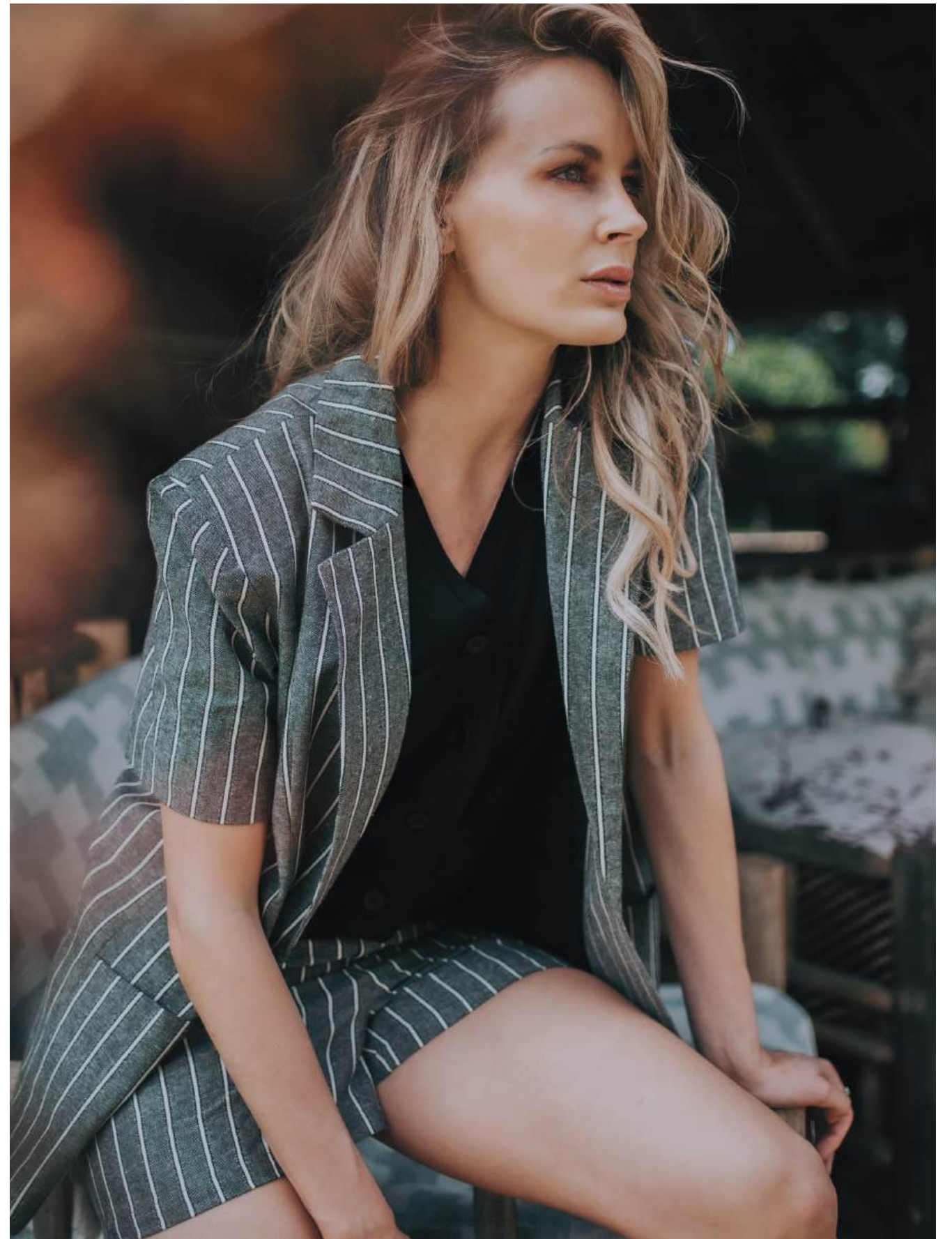
SHORTS: RANDBURG €79.99 - BLAZER: SANDTON €159.99 - GILET: PATRAS €69.99