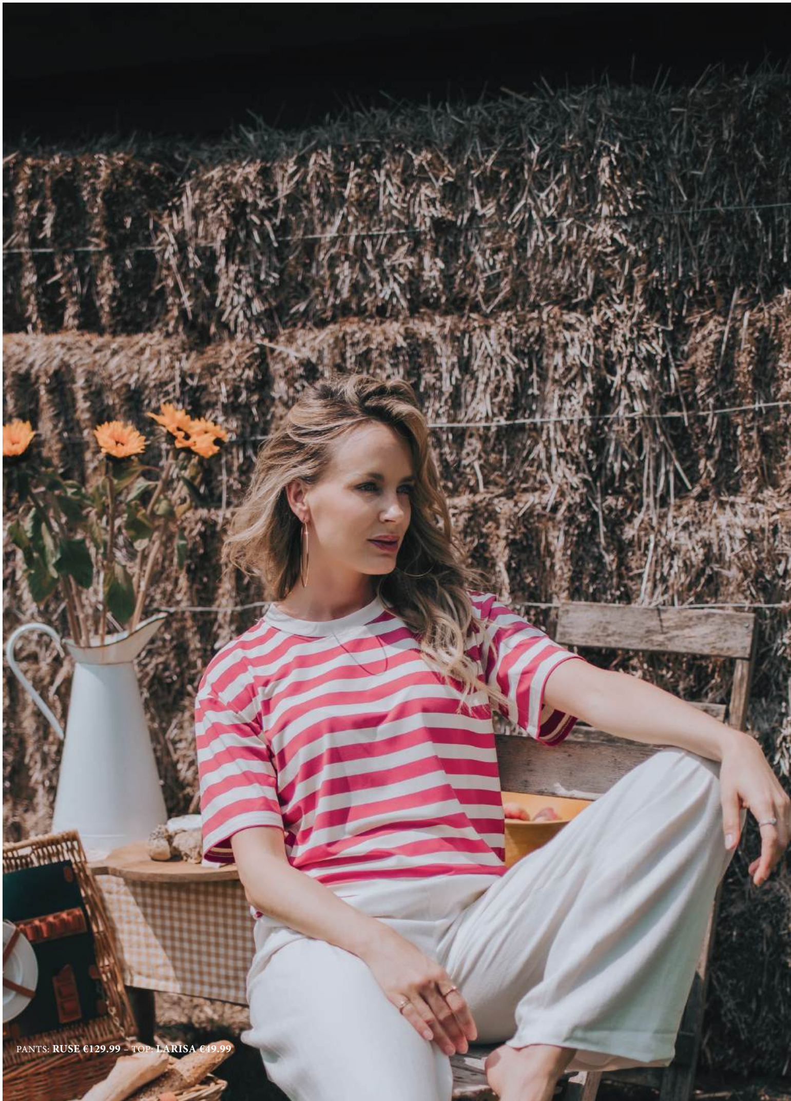
PANTS: RUSE €129.99 - TOP: LARISA €49.99