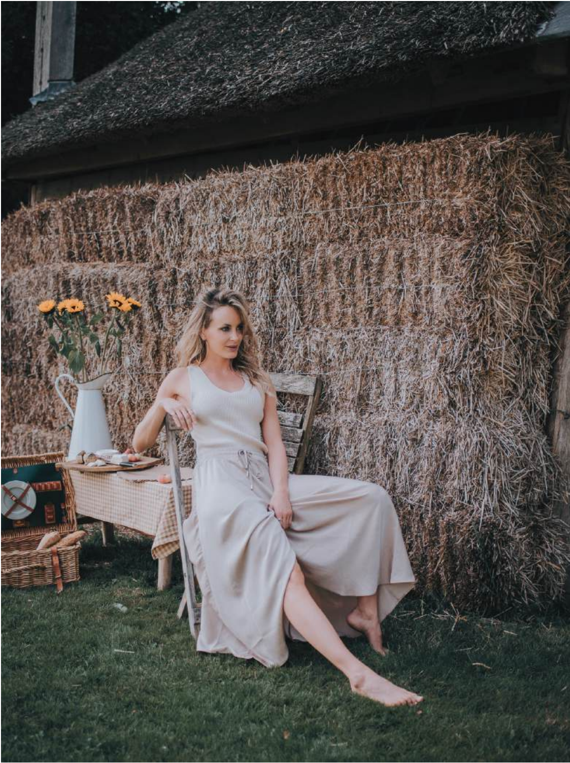
SKIRT: ABA €89.99 – TOP: SERRES €59.99