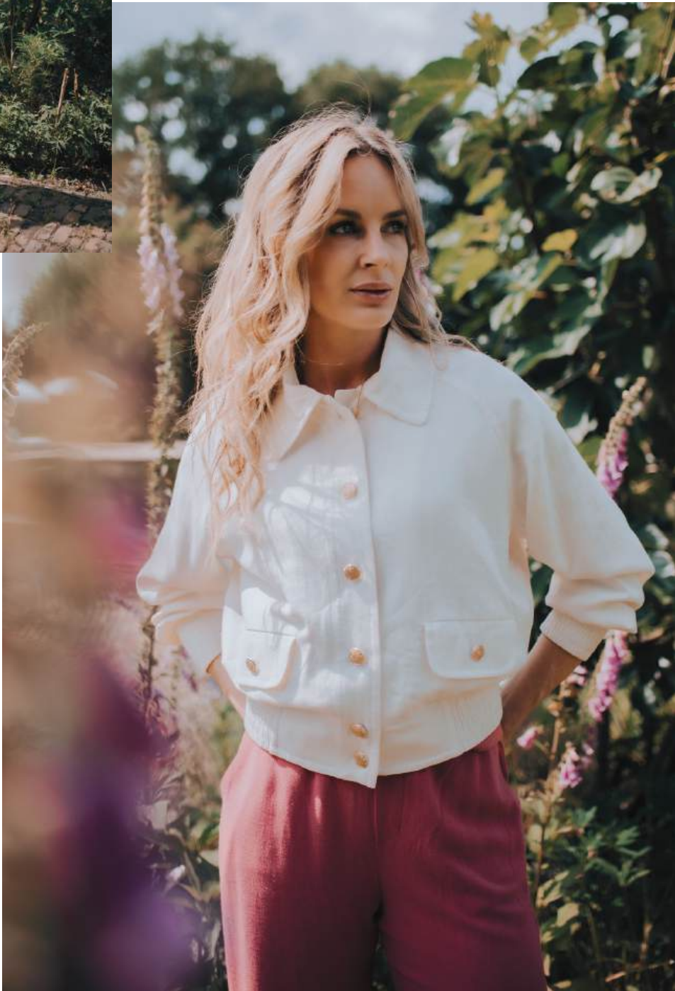
PANTS: ISTANBUL €89.99 - GILET: SURAT €79.99 - JACKET: LUBLIN €169.99