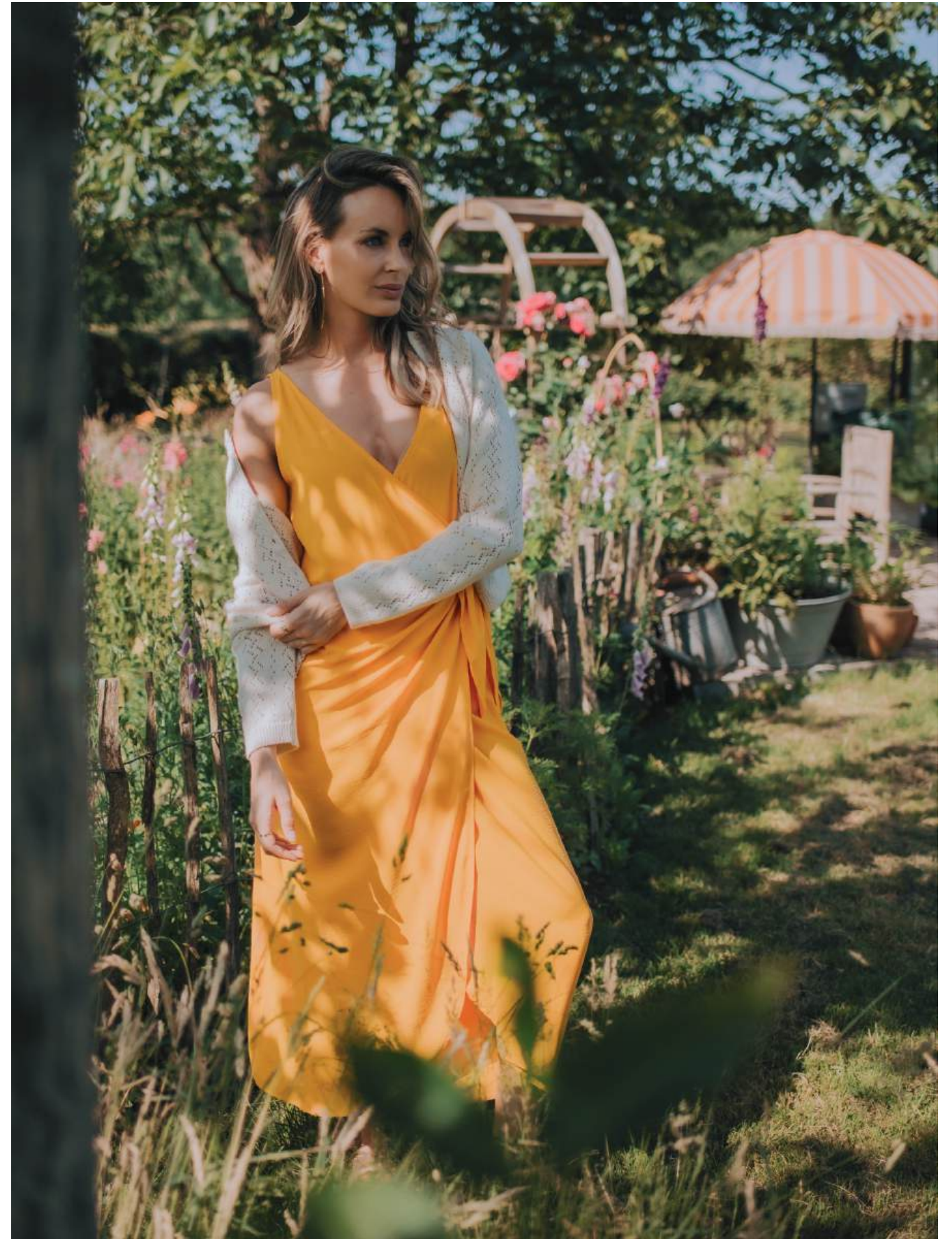
DRESS: MARLOW €79.99 – CARDIGAN: RHODOS €99.99