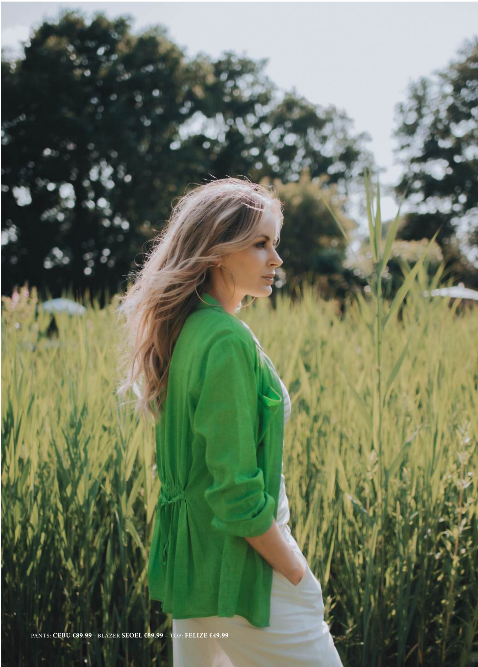
PANTS: CEBU €89.99 - BLAZER SEOEL €89.99 – TOP: FELIZE €49.99