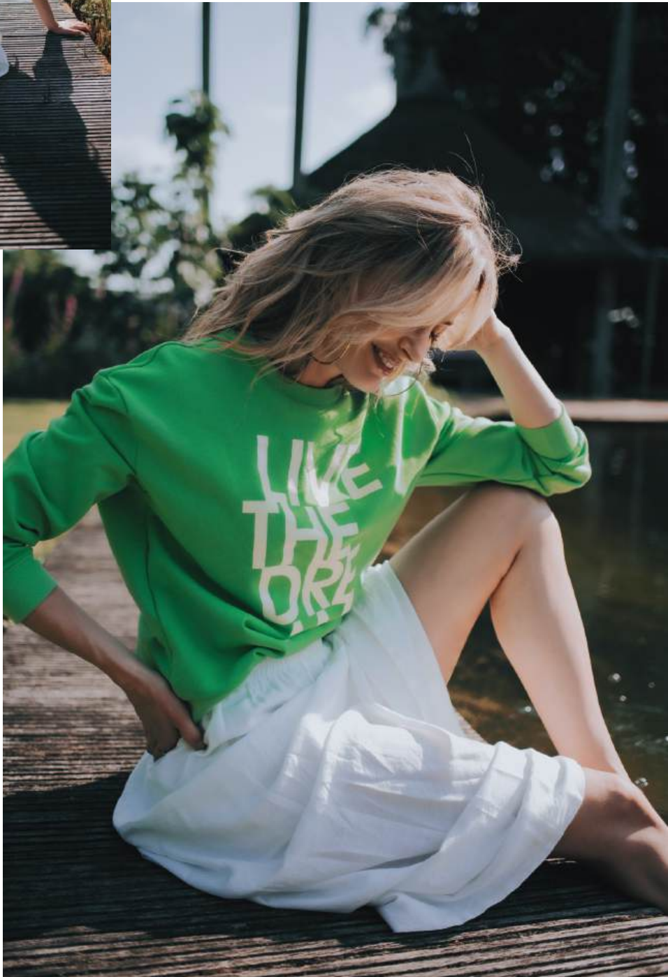
SKIRT: ALTOS €89.99 – SWEATER: CAPRI €89.99