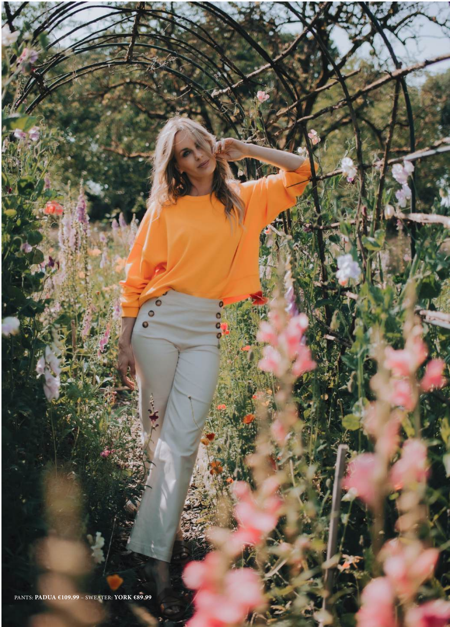
PANTS: PADUA €109.99 – SWEATER: YORK €89.99