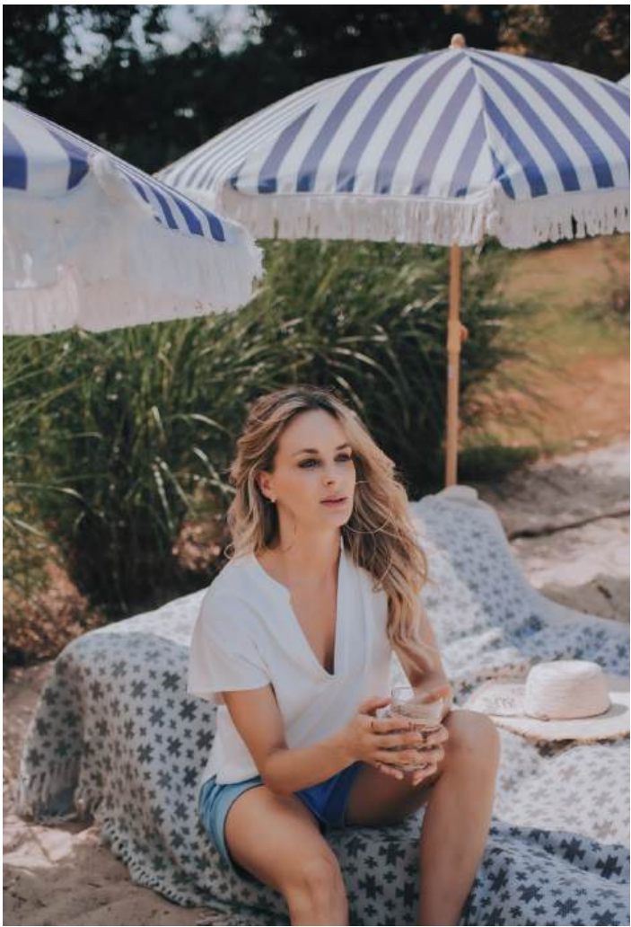
SHORTS: ANCONA €79.99 – BLOUSE: LAVAL €79.99