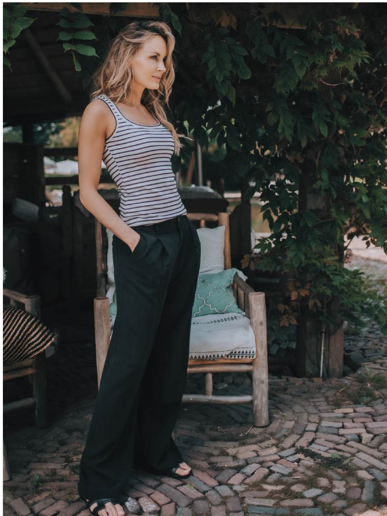
PANTS: PIRAN €119.99 – TOP: FELIZE € 49.99