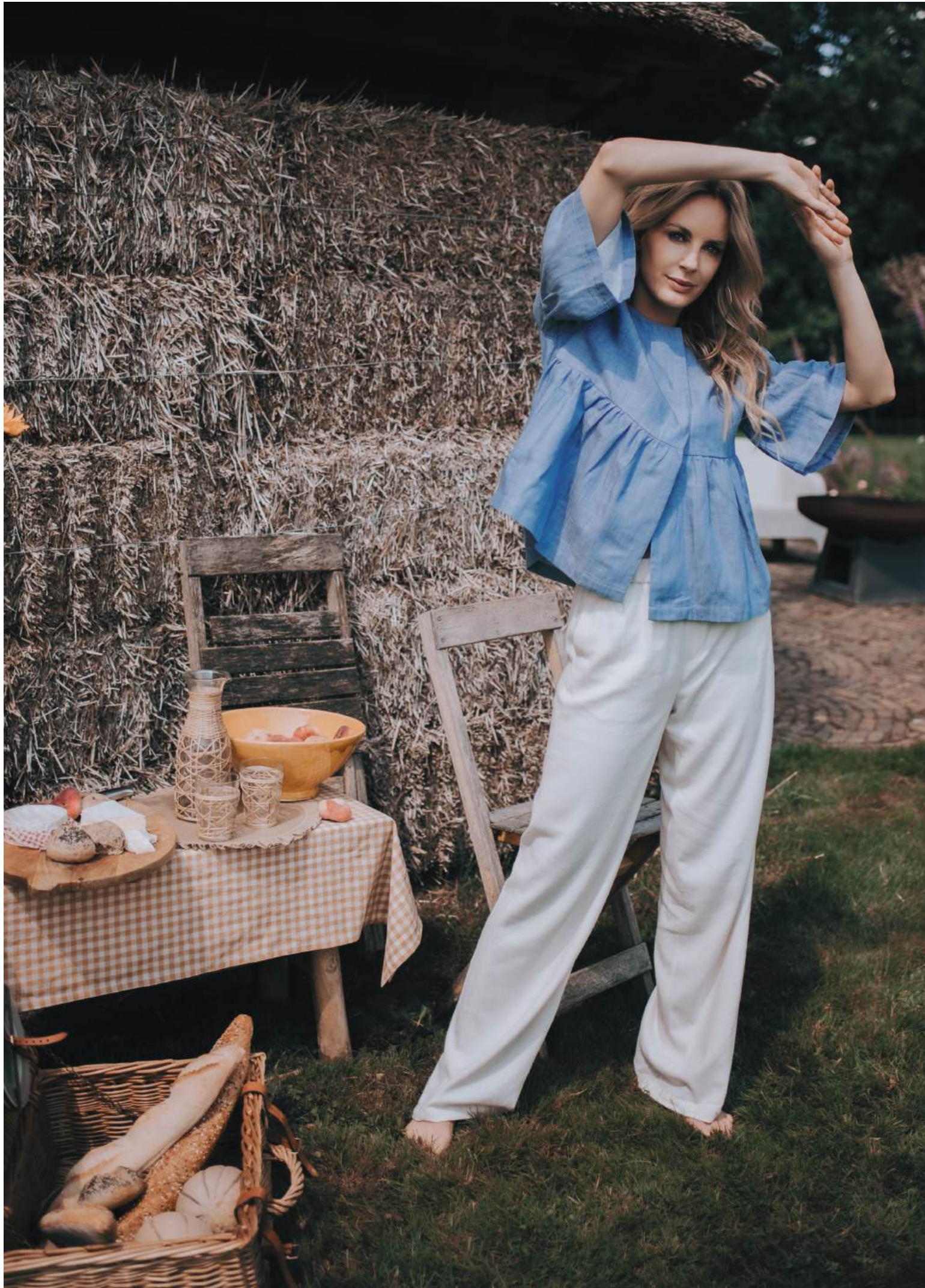
PANTS: RUSE €129.99 – BLOUSE: KHOST €119.99