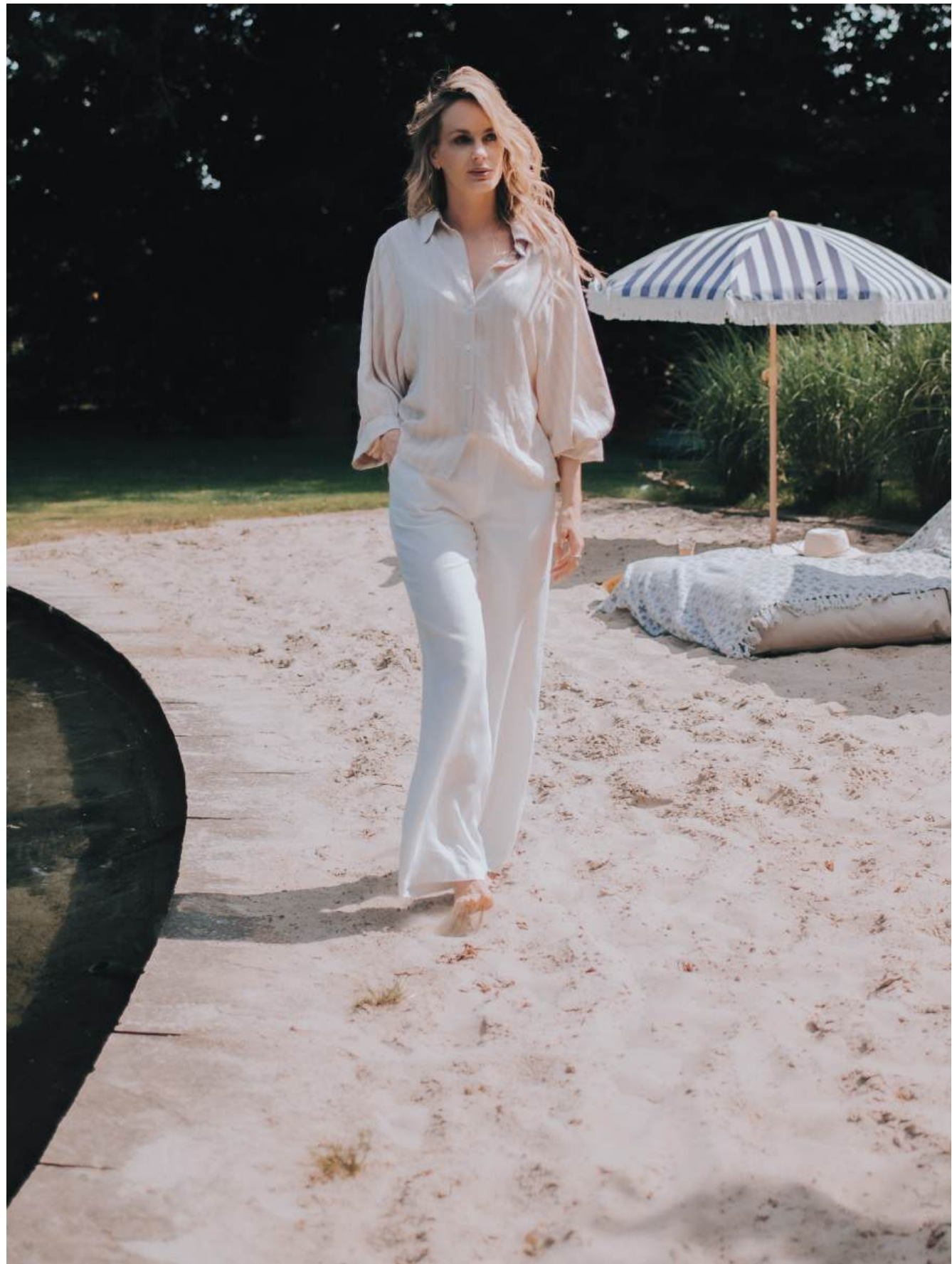
PANTS: CEBU €89.99 – BLOUSE: BUSAN €89.99